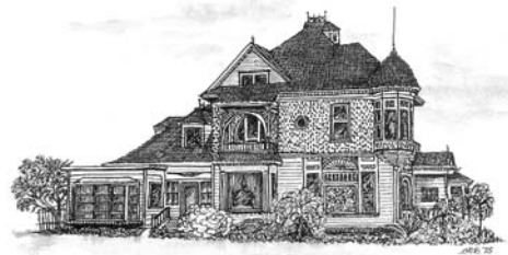
The Dr. Willella Howe-Waffle House, Medical Museum, and Carriage Barn. Built 1889. Saved from demolition 1975.