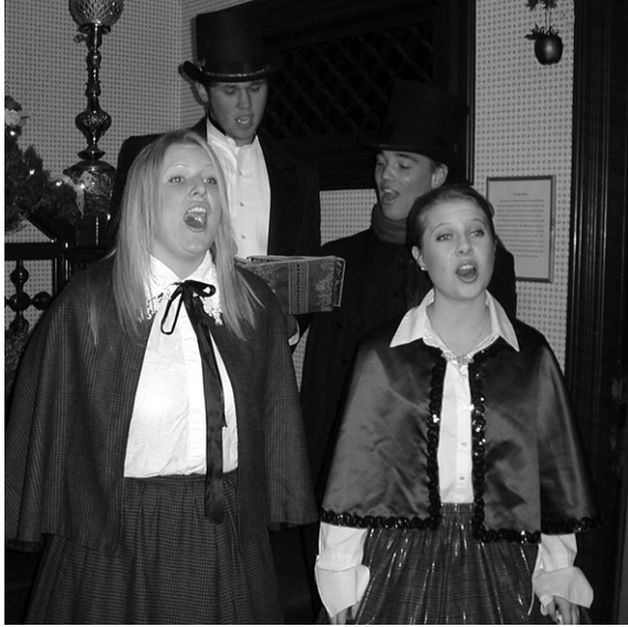
Foothill High School Singers